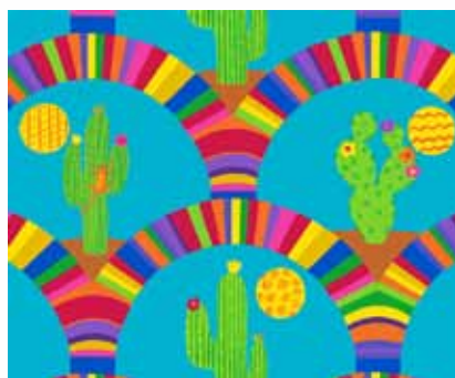
5358-T 2/3 yd