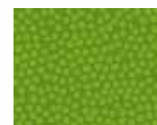
2847-G5 1/8 yd