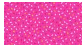
5361-E 1/4 yd