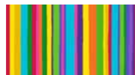
5360-M 3/8 yd (binding)