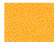
2847-Y3 1/2 yd