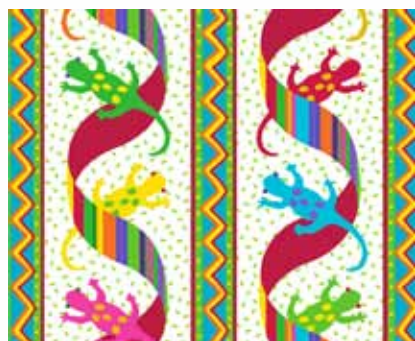
5357-M 1 1/2 yds