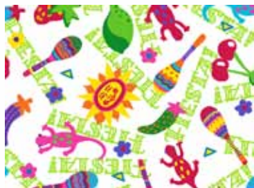
5356-M 1/2 yd