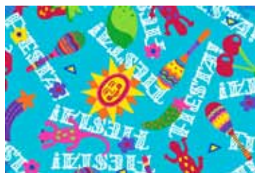
*5356-T 1/4 yd (extra yardage needed for backing)