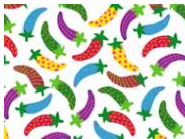
5359-M 1/4 yd