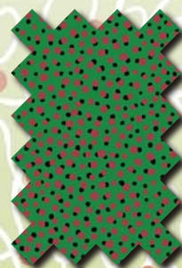
4143-G **1 yard