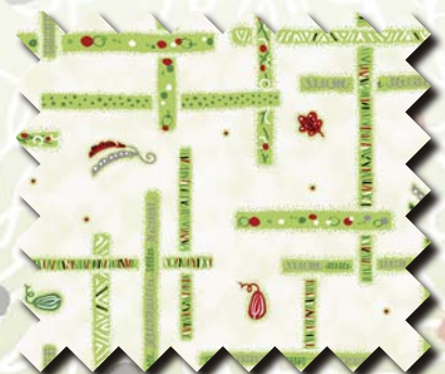
4140-G *¼ yard