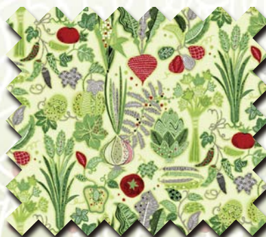
4139-G ⅔ yard