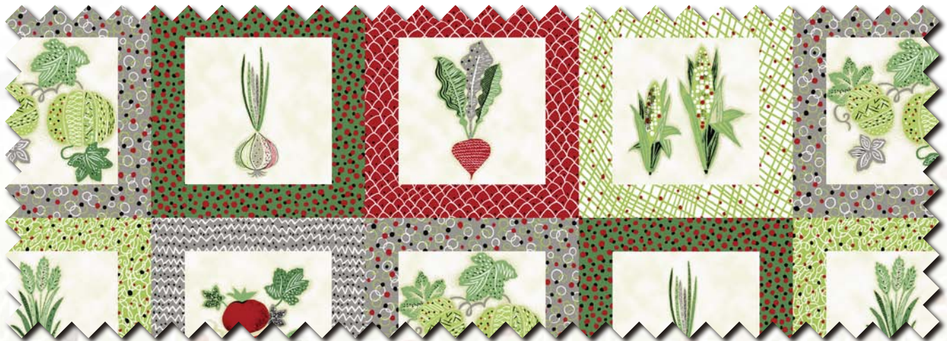
4136-G ¾ yard