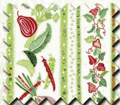
4138-G 1 ⅜ yards