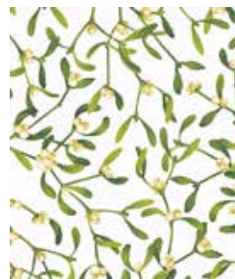
8143-L 3½ yds (extra yds needed for backing)