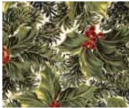
3977-ML* ⅔ yard