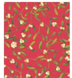
8143-R 1¼ yds