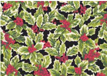
8141-K ¾ yd

Yardage needed for backing: 8½ YDS per kit