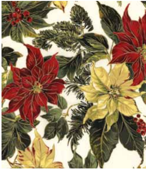
3975-ML* 1¼ yards

Fabrics shown are 20% of actual size. *Indicates fabrics used in quilt pattern.