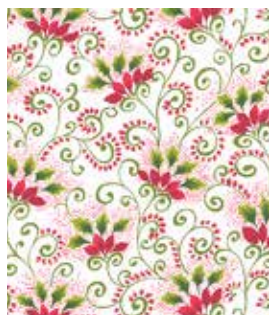
8142-L ¾ yd