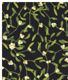
8143-K 3½ yds (includes binding)