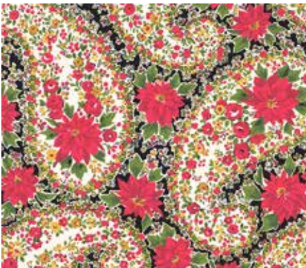
8140-K 2 yds

Yardage needed for backing: 8½ YDS per kit