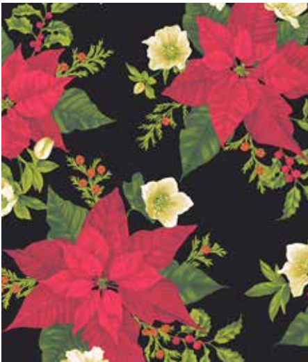
8139-K 1¼ yds