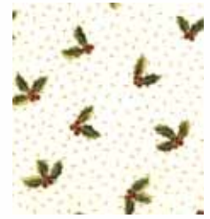
3979-ML* 3⅛ yards (additional yardage needed for backing)