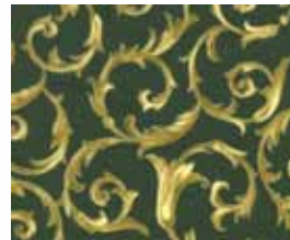
3978-MG* 2¼ yards