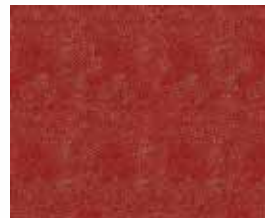
1867-MR* 2 yards (includes binding)