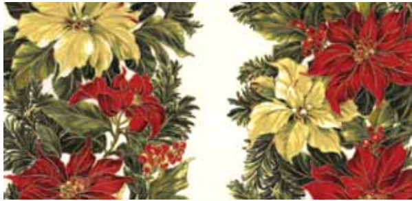
3976-ML* 2 yards