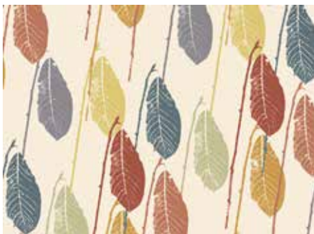
7704-KL 5½ yds (backing)