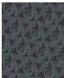
7707-K ¾ yd