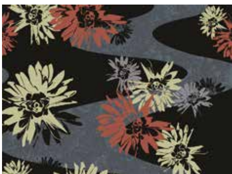
7703-K 2½ yds