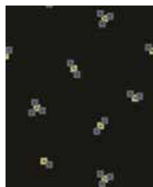
7708-K 1 yd