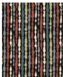
7706-K ¾ yd