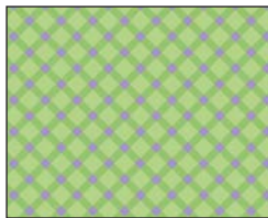
4966-G 1/2 yard