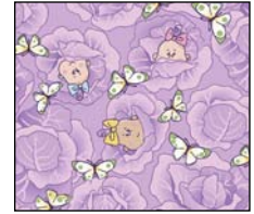
4961-P 1/4 yard