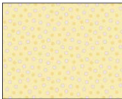
4965-Y 1/3 yard