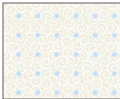
4967-L 1/2 yard