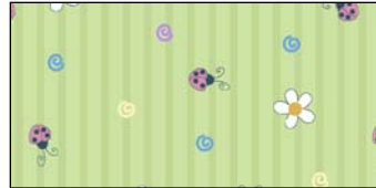
4964-G 1 1/8 yards