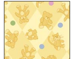
4962-Y 1/3 yard