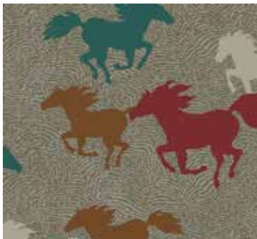
5212-C 1½ yds