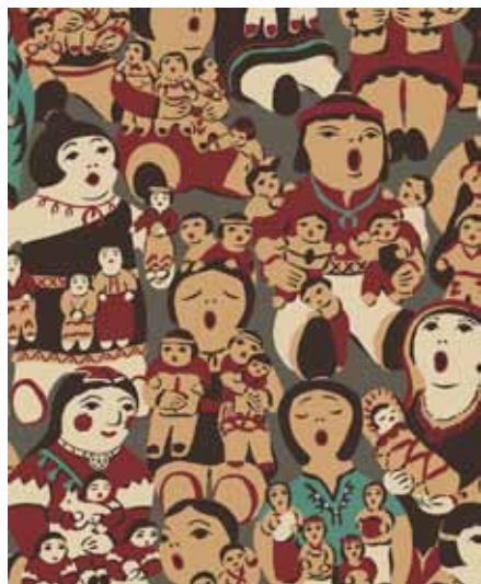
5211-C 1 yd

Inspired from the collections of The Museum of Indian Arts and Culture, Santa Fe