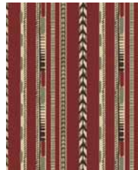
5214-R 2½ yds