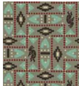
*5213-C ¾ yds (extra yardage needed for backing – 6½ yds)