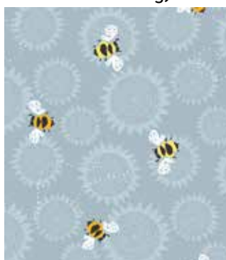
7757-C 1 1/4 yds