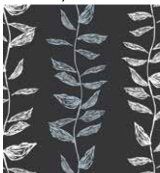
7756-CK 1 yd (extra yds needed for backing)