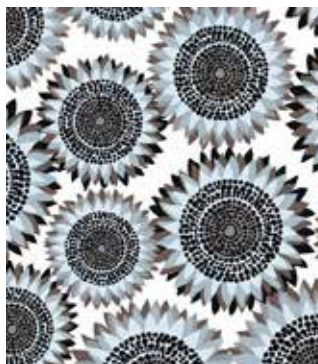
7755-C 1 yd