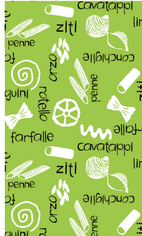
7886-KG \frac{1}{3} yd Runner \frac{1}{2} yd Quilt