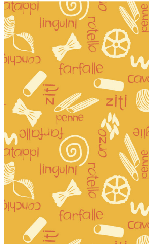
7886-NY \frac{1}{3} yd Runner \frac{1}{2} yd Quilt