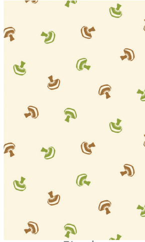
7888-N \frac{7}{8} yd Runner 1 \frac{2}{3} yds Quilt