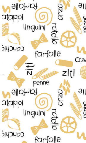
7886-K 2 yds Runner (includes binding) 3 \frac{1}{2} yds Quilt