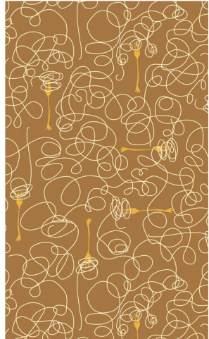
7887-N \frac{1}{2} yd Runner \frac{7}{8} yd Quilt