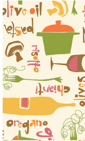
7885-N \frac{1}{2} yd Runner \frac{7}{8} yd Quilt