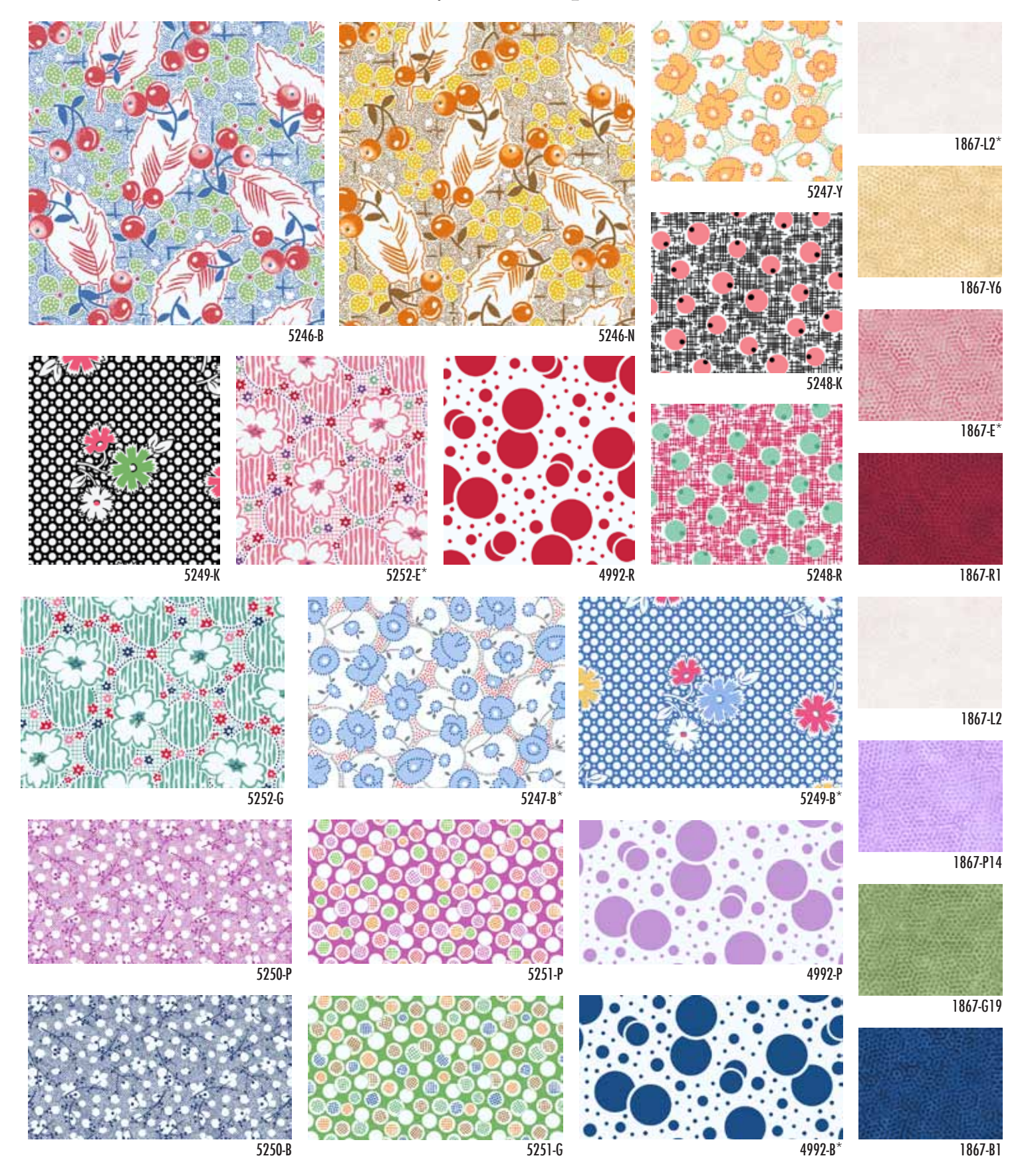
*Indicates fabric used in quilt pattern. Fabrics shown are 40% of actual size. 6/2/10