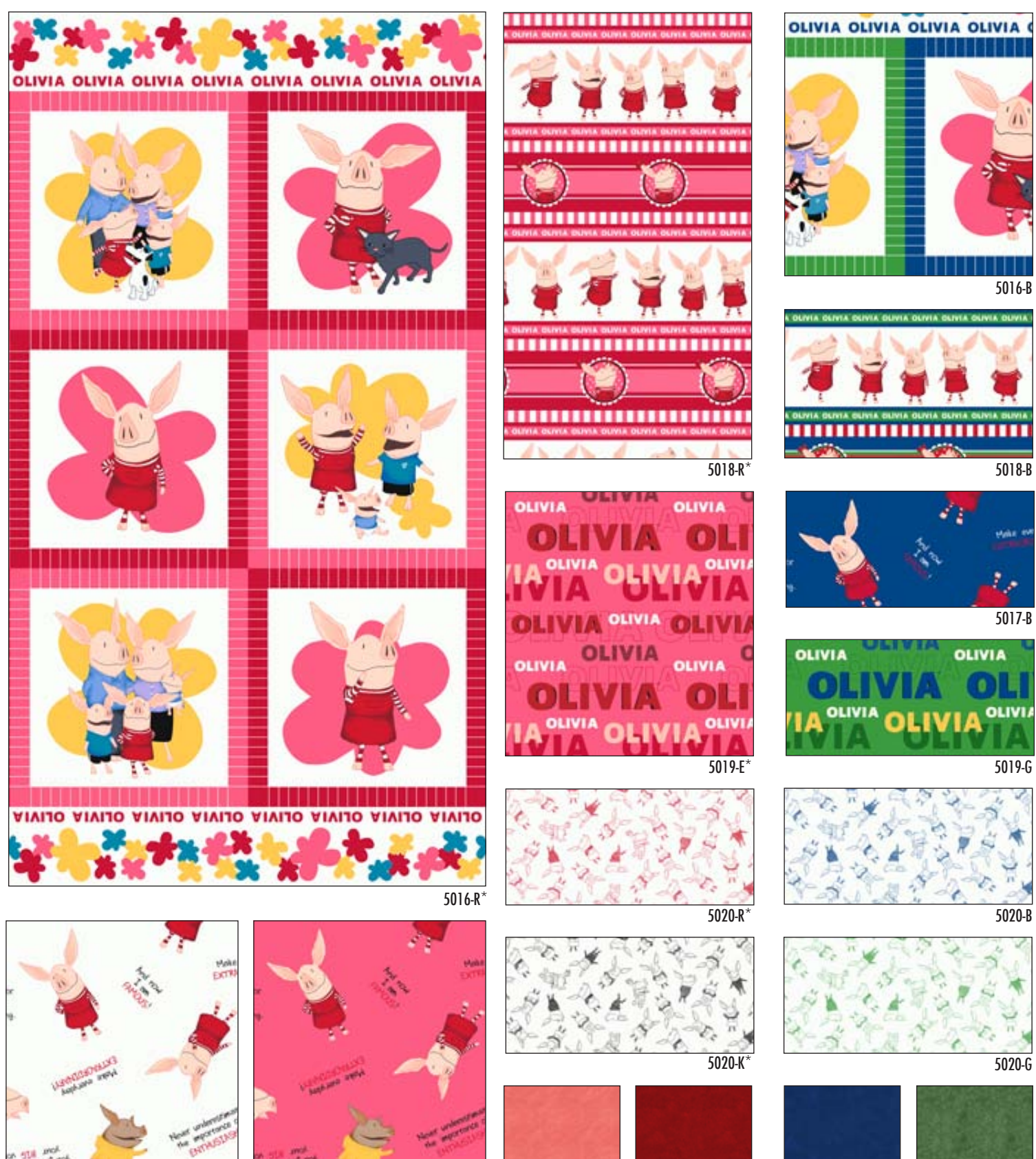
by Ian Falconer