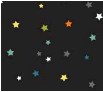
2274/X Multi Stars