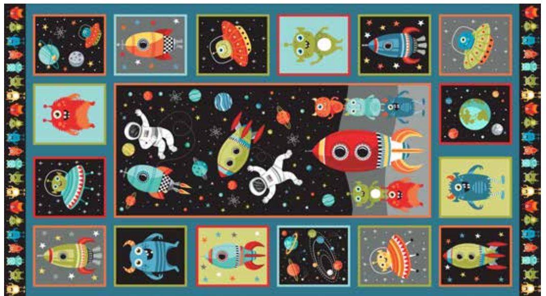
2273/1 Panel - each panel (60 x 112cms (24" x 44"))