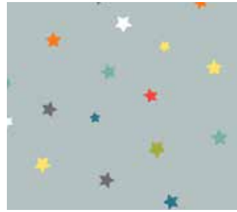
2274/S Multi Stars