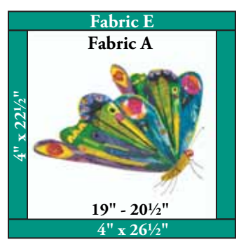
Panel Block Make 2

with the top and bottom of the panel. Sew the longer Fabric E borders to the top and bottom. Centering the printed panel, trim the block to 24½" square. Repeat to make 2 blocks.