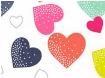
1819 W Hearts