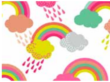
1818 W Rainbows