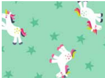
1817 T Unicorns