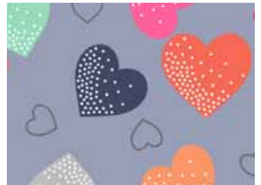
1819 S Hearts