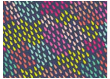
1821 B Raindrops