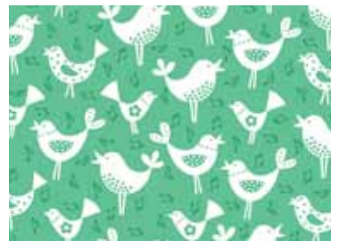
1820 T Birds