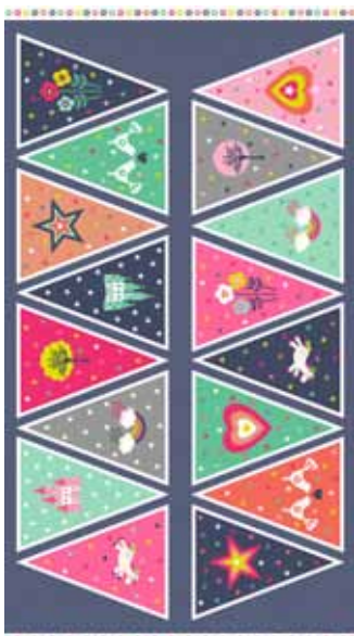
1823/1 Bunting Flags

Actual size shown 60 x 112cms (24" x 44")