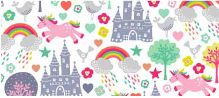
1816 W Scenic