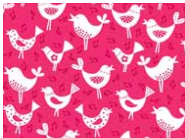
1820 P Birds