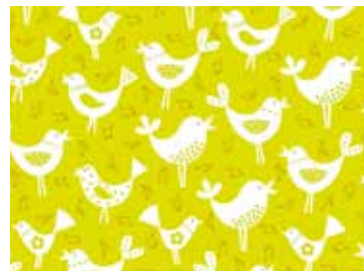
1820 G Birds