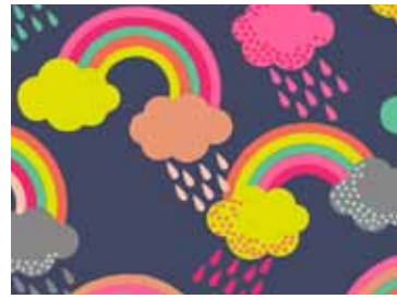
1818 B Rainbows