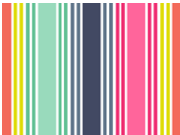
1765 P Multi Stripe