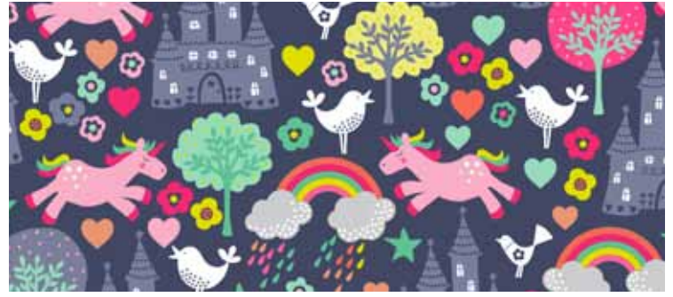
1816 B Scenic