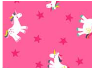
1817 P Unicorns