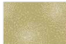
8374-N** 1 1/4 yds (includes binding)