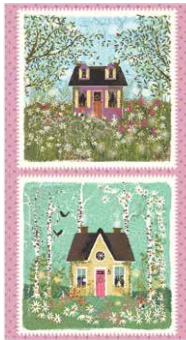
8369-P* 1 panel