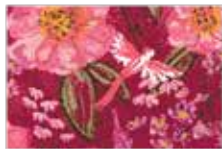
8370-R** 1/4 yd