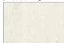
A-C-Natural 2 1/2 yds

Blend with fabrics from Chambray by Andover Fabrics