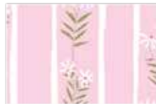
8371-E** 4 1/4 yds (includes backing)