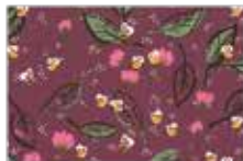
8372-P** 1/4 yd