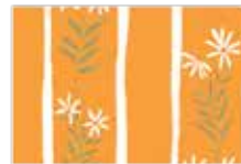
8371-O** 1/4 yd