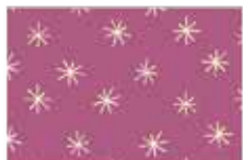
8373-P** 3/8 yd