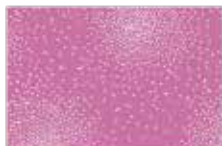
8374-P** 1/4 yd

Blend with fabrics from Chambray by Andover Fabrics