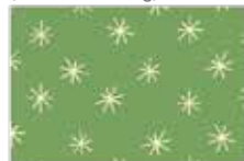
8373-G** 3/8 yd