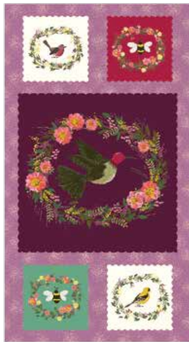
8368-P* 1 panel