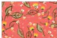
8372-O** 1/4 yd