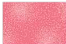
8374-E** 1/4 yd