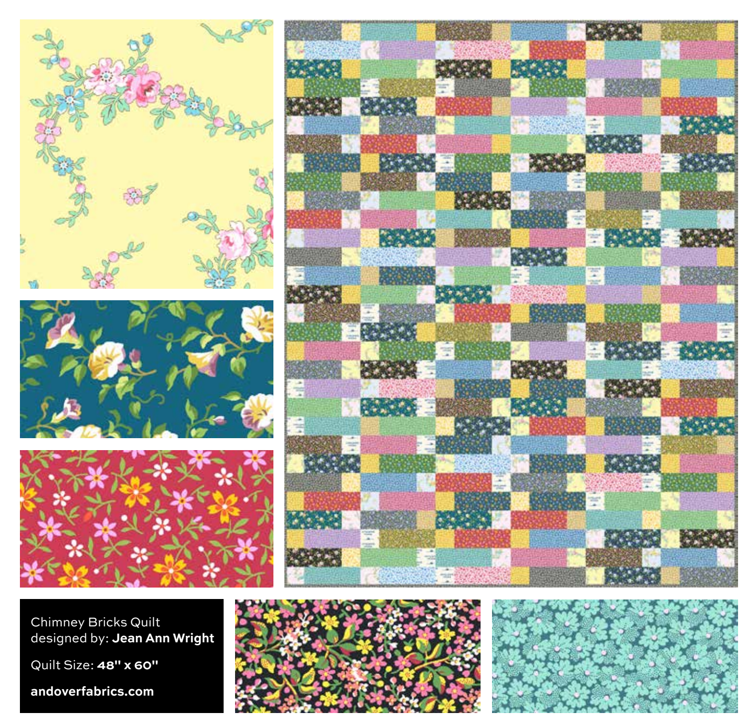
LITTLE HOUSE ON THE PRAIRIE® and associated character names and trademarks are owned and licensed by Friendly Family Productions, LLC. All rights reserved. ©2015 Friendly Family Productions, LLC